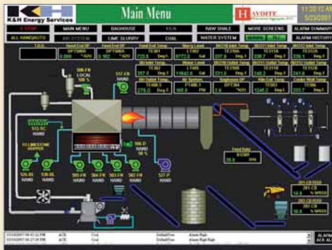
Figure 1: DiGeronimo Aggregates HMI screen.

But the plant's new owners had a more modern vision and aspirations to improve productivity and product quality while planning for future expansion. They set about transitioning the facility to coal fuel, upgrading the electrical system and other equipment to better meet EPA regulatory requirements, and improving the overall efficiency of the enterprise.