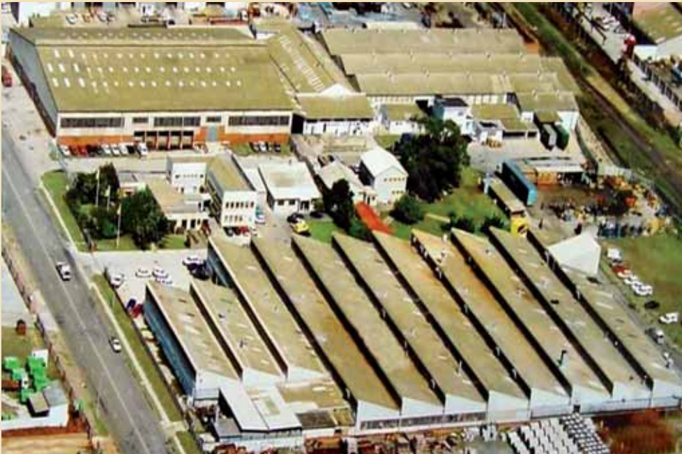
Figure 3: Aerial view.