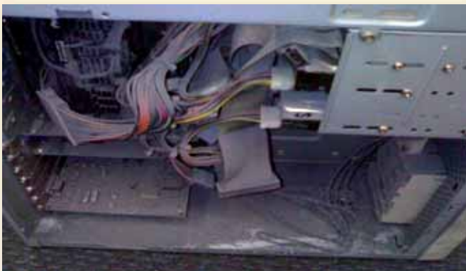
Figure 1: Not the best environment for electronic equipment.

In order to live up to Schaeffler's (LuK's) exacting quality standards while meeting large demands, the production process of these facings at the