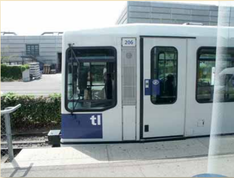
Figure 2: The M1 Tramway at EPFL station.